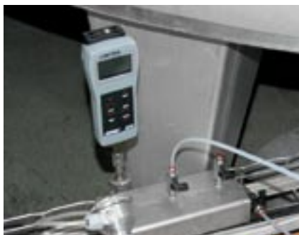
Validation of pressure transducer