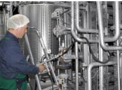
Pressure testing of a tubular heat exchanger