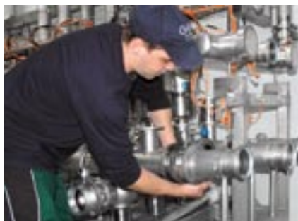
Demounting work prior to leakage testing