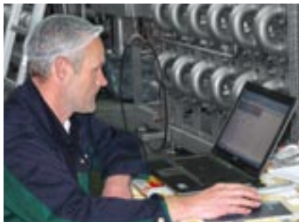
On-site documentation of tasks performed