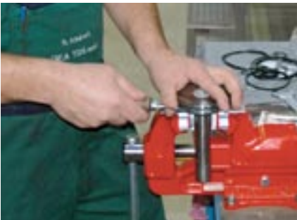
Exchange of a seal in a VARIVENT valve

Exact tests of the measuring systems prevent mistakes in production.