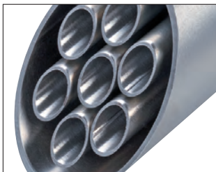
Plain inner tubes

Flowmeters, temperature sensors and pressure gauges are provided to monitor the process parameters during the tests. The data obtained is used for the detailed design of the plant.