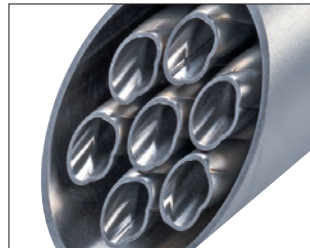
Corrugated inner tubes